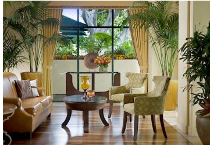
Marriott San Diego Mission Valley